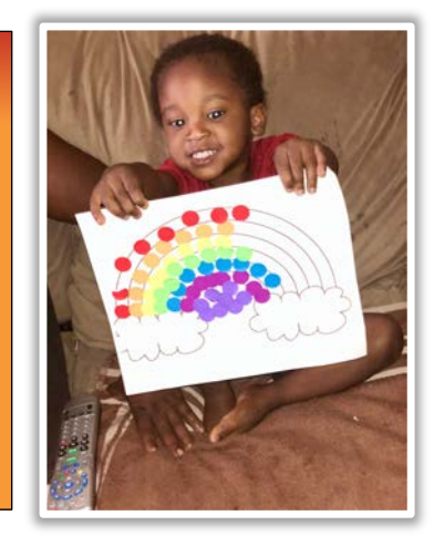
"The children love the packets and come running when they see me coming to deliver them" Parent/ Delivery Angel

The Victory Train<sup>®</sup> of Greene County Building a Pathway to Graduation! www.victorytrain.org